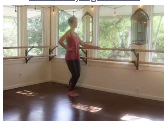
FAITH POSTURE Barre Core, Legs & Glutes