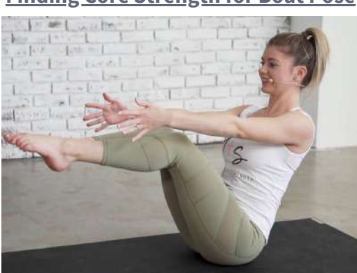
CENTRED Finding Core Strength for Boat Pose