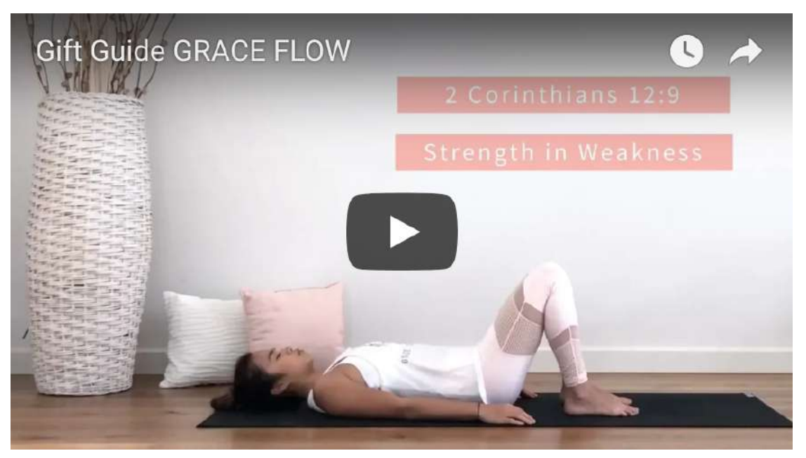
Access: https://www.gracexstrength.com/present-ebook Password: Presentgxs2018